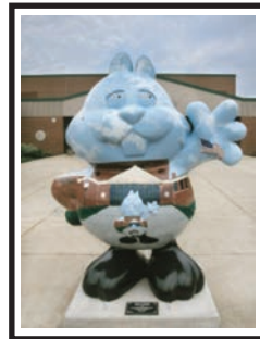
"Start to Finish" Sponsored by Punxsutawney Area Middle School