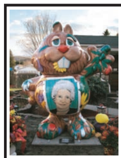
"A Garden Philled w/Memories" Sponsored by The Original Sarah L. Defelice Pizza House