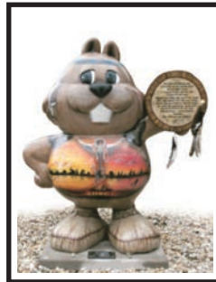
"Punksutenink Phil" Sponsored by Marion Center Bank