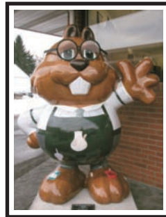
"Phil My Prescription, Please" Sponsored by Stewart's Drug