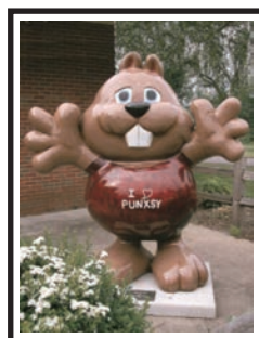
"Phil'd with Love" Sponsored by Mulberry Square