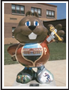
"Oh The Places Phil Will Go" Sponsored by PAHS Art Club