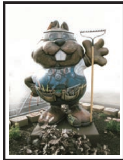
"There's Work to be Done" Sponsored by Ragley's True Value Hardware