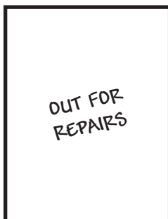
"Look at the View" Sponsored by Johnston Furniture