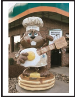
"Breakfast Sounds Good" Sponsored by Gimmick's Restaurant