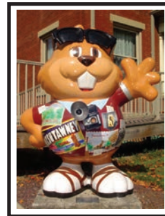
"Postcards from Phil" Sponsored by Punxsutawney Rotary Club