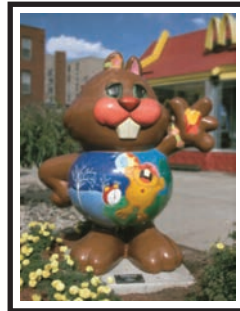
"It's Springtime for Phantastic Phyllis" Sponsored by Gene Puskash