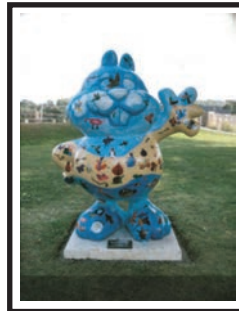
"It's a WonderPhil World" Sponsored by the Punxsutawney Women's Club