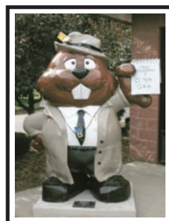
"The Spirit of Punxsutawney" Sponsored by the Punxsutawney Spirit