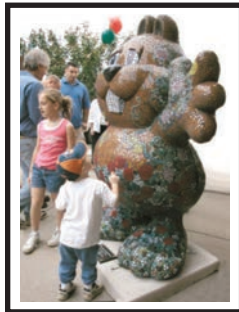
"Get Your 'Phil' of Roses" Sponsored by Roseman's Florist