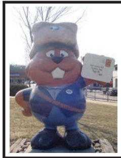
"Philatelic" Sponsored by Employees of the Punxsutawney Post Office