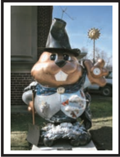
"The Wizard of Weather" Sponsored by NW PA's Great Outdoors