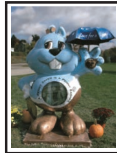
"Phil your Piggy Bank" Sponsored by S & T Bank