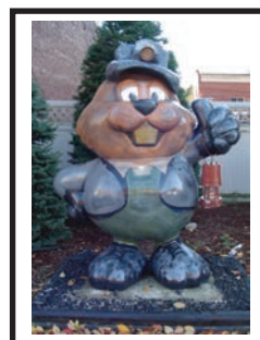
"Philtuminous: The Heritage Hog" Sponsored by Miller Brothers Furniture