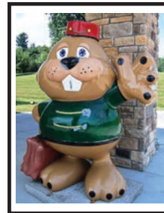
"Phil'd With Service" Sponsored by Cobblestone Hotel & Suites