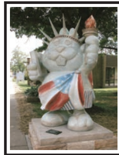
"Freedom Phil" Sponsored by the Groundhog Festival Committee