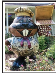
"Through the Eyes of Pizzeria Phil" Sponsored by Laska's Pizza