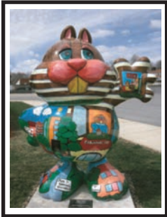
"Phil A House With Love" Sponsored by the Jefferson County Housing Authority