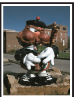
"Presby MacPhil" Sponsored by The Presbyterian Church of Punxsutawney

"The Punxsutawney Groundhog Club & NW Pennsylvania's Great Outdoors present..."